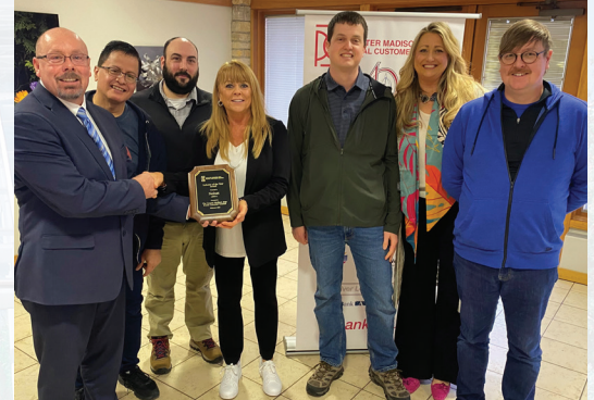
Nelnet - GMAPCC 2024 Industry of the Year award winners

Visit us at https://www.madisonpcc.com/news to complete your nominations today!